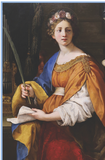
Pietro da Cortona, Saint Cecilia , 1620-25.