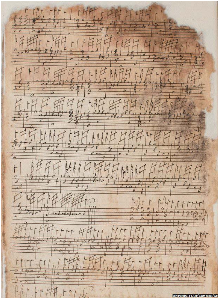
Kemp's Jig, written in celebration of the actor, William Kemp, a member of Shakespeare's acting company