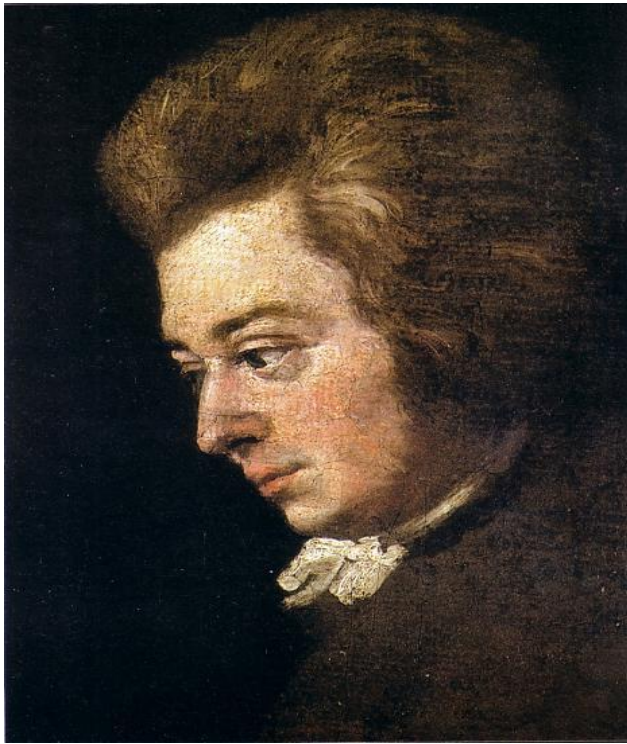
Portrait of Mozart (c.1790) Joseph Lange (1751-1831)