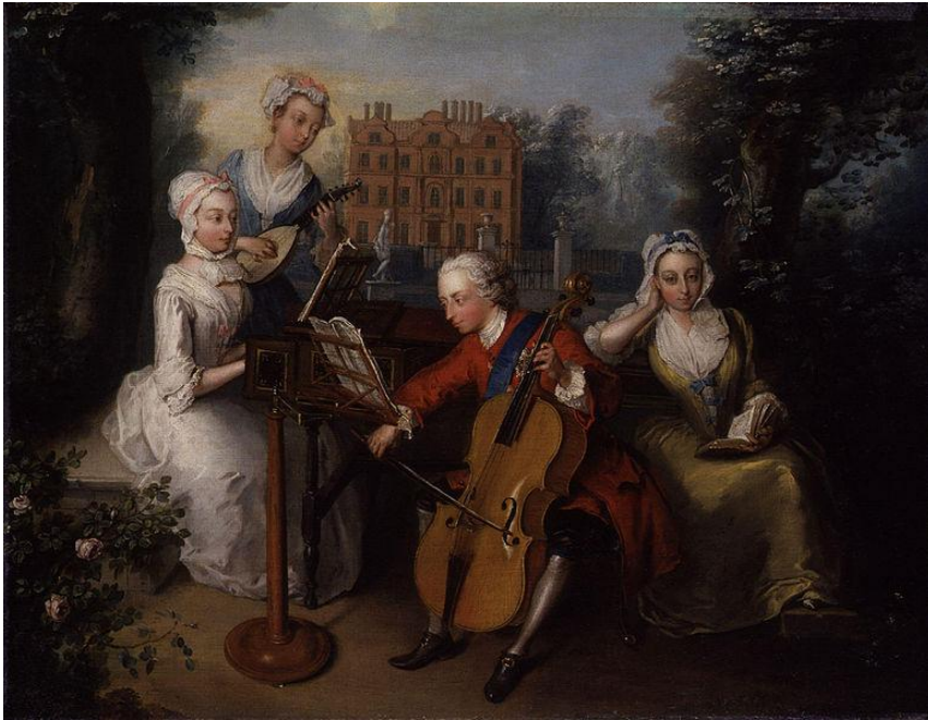
Frederick, Prince of Wales and his sisters (1733) Philip Mercier (1689-1760)