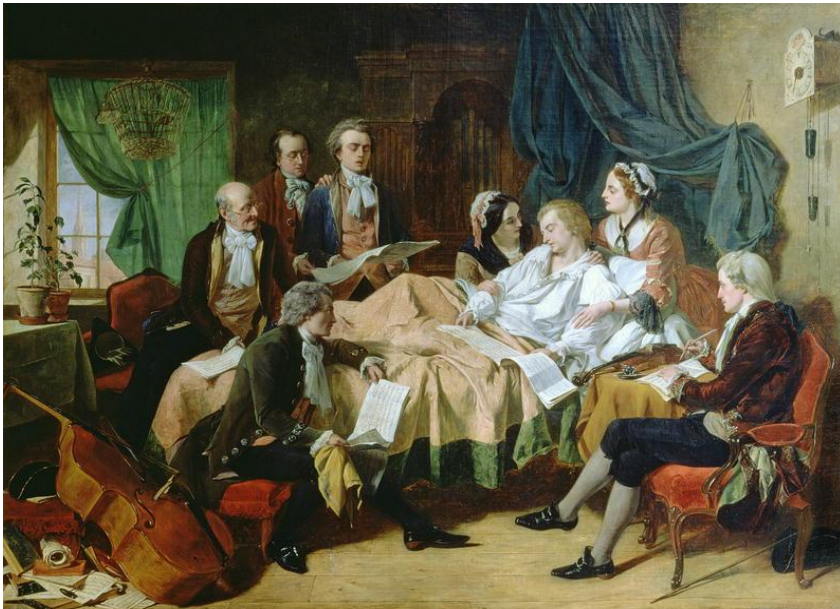
The Last Hours of Mozart (c.1860) Henry Nelson O'Neil (1817-1880)