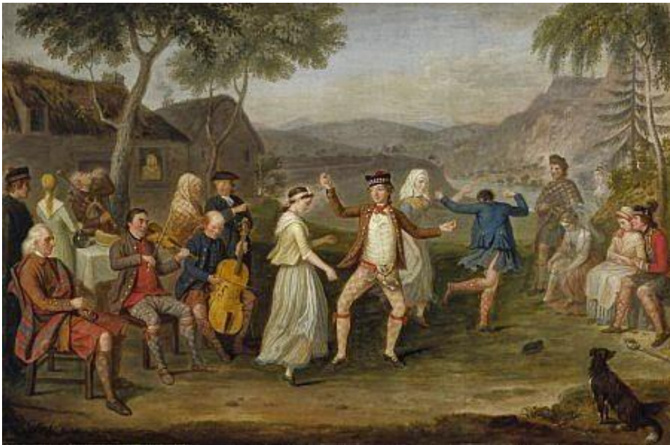
David Allan "Highland Wedding at Blair Atholl" (1780)