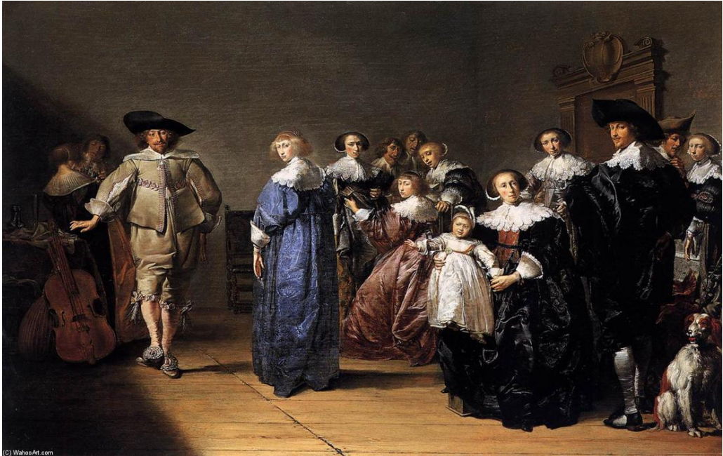
Pieter Codde "Merry Company" (1633)