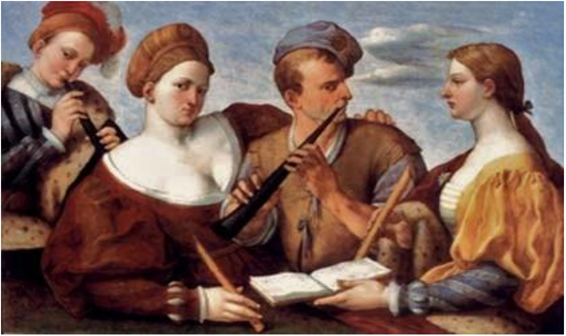
Bernardino Licinio "A Concert" (1520)