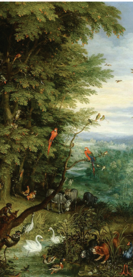
Jan Brueghel the Elder, Adam and Eve in the Garden of Eden , 1615.

Schroeder Hall, Green Music Center Sonoma State University Rohnert Park