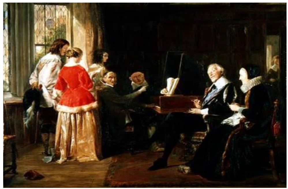
John Calcott Horsley A Madrigal (19th century)