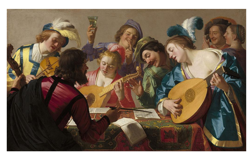
Gerrit van Honthorst The Concert (1623)