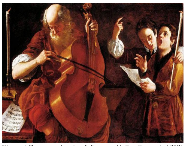
Giovanni Domenico Lombardi Concert with Two Singers (c 1700)