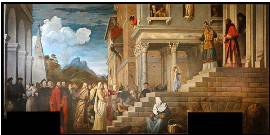
Titian: Presentation of the Virgin in the Temple Accademia, Venezia