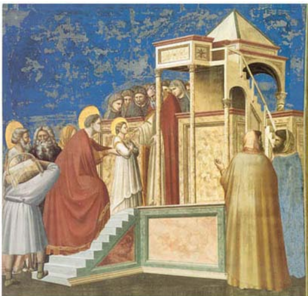
Giotto: Presentation of the Virgin in the Temple Scrovegni Chapel, Padua