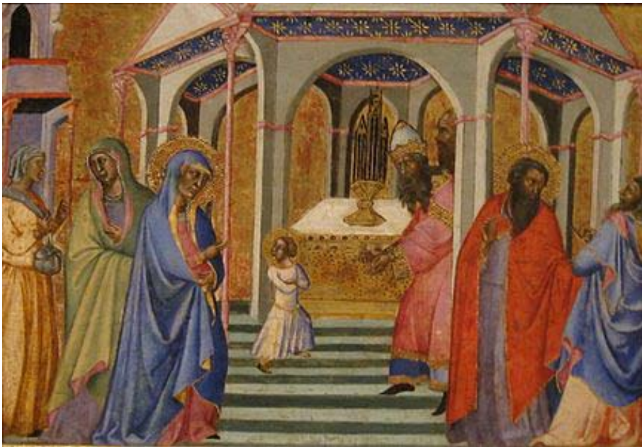
Bartolo di Fredi, Presentation of the Virgin, c. 1360