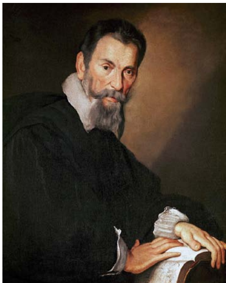
Monteverdi, Bernardo Strozzi (c.1630)