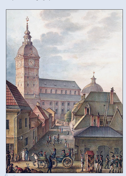
Carl Ludwig Engel, Turku Cathedral, 1814.

—Anonymous biography of Heinrich Suso (ca. 1328)