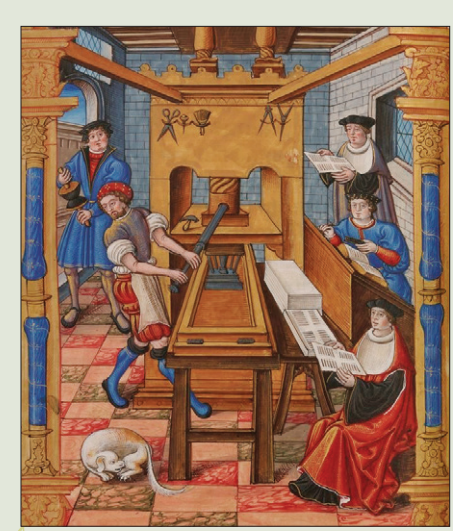
Artist unknown, Frontispiece from Chants royaux sur la Conception, couronnés au puy de Rouen de 1519 à 1528, 16<sup>th</sup> century.

-Preface to Second Royal Privilege granted to Attaingnant, 1531